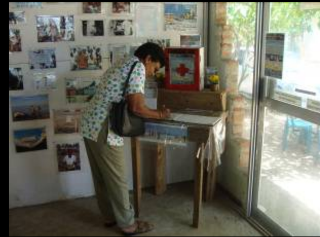
Tsunami Photo Museum