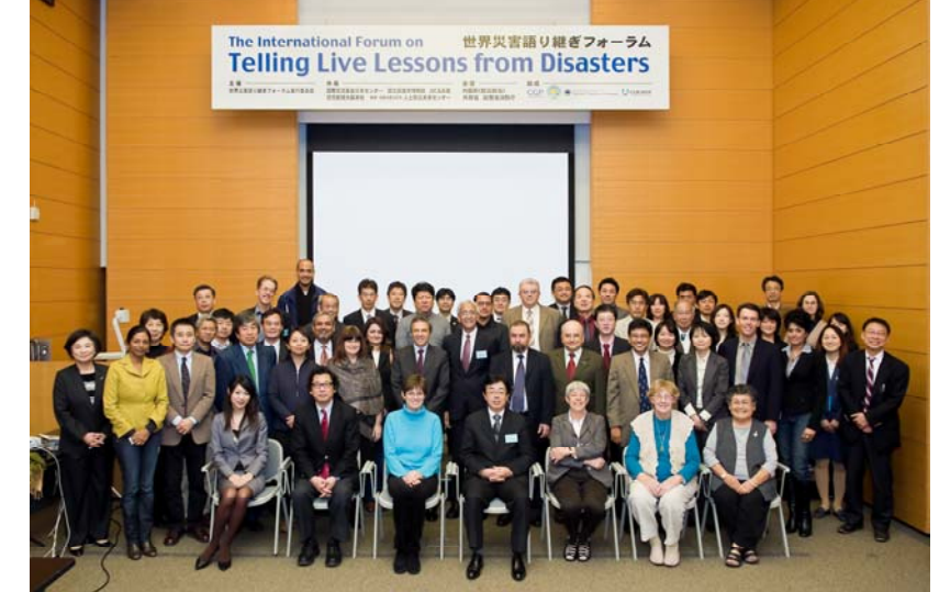
Speakers and Facilitators