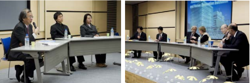
Tripartite Talk